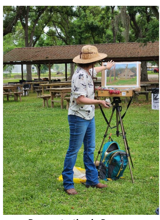
Demonstration in Progress