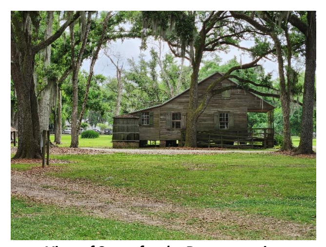
View of Scene for the Demonstration

Members and guests were treated to a great paint out at Destrehan Plantation. Coffee and donuts were served at a meet and greet before the demonstration. Then we adjourned to a nearby location with a view of one of the slave houses where Melissa Ladner treated us to a great demonstration.