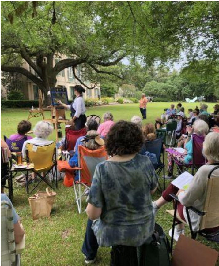
Enjoying the Demo