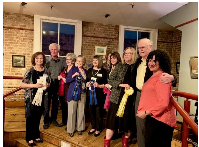
Degas Award Winners Present at the Reception