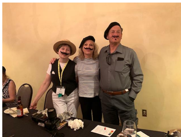
The French Contingent at IAPS