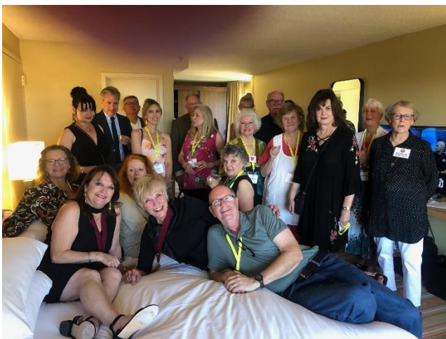
Enjoying the Degas Pastel Reception