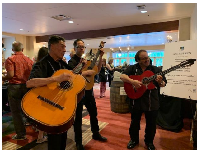
Music at the Fiesta