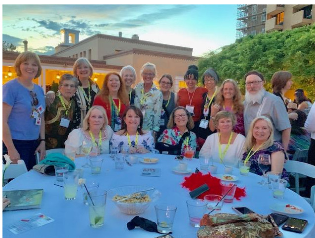
Enjoying the evening at IAPS the Degas Members were soon joined by other friends