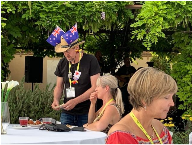
The Kiwi's from New Zealand