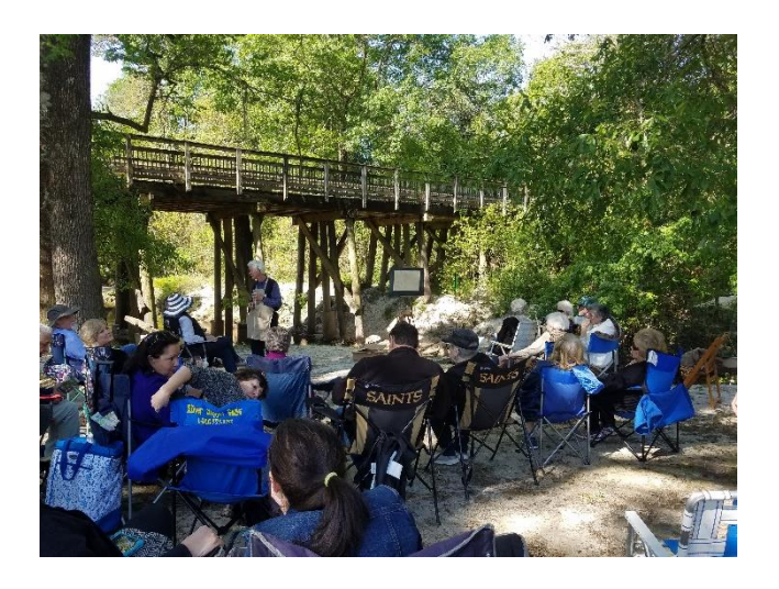
Scene of the Demonstration