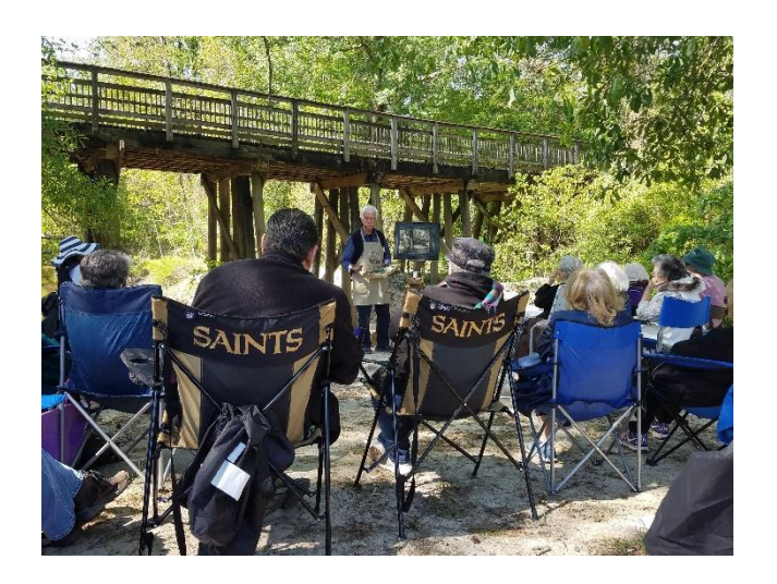
Explaining the Painting Steps