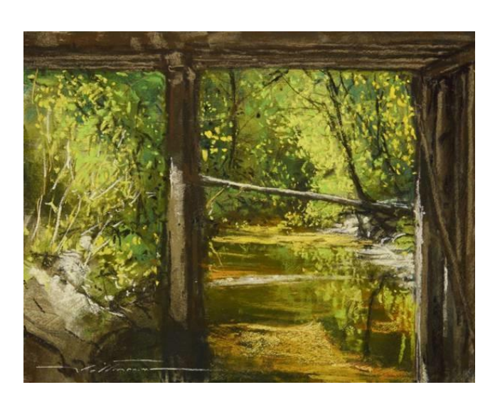
The Finished Plein Air Painting